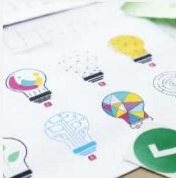
Special award START-UPS