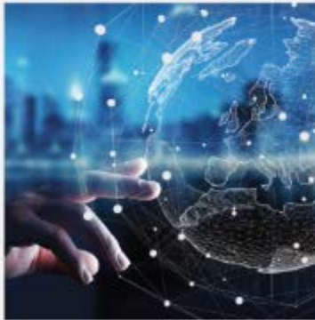
Category II INNOVATION