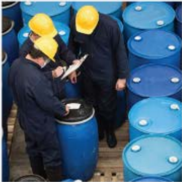
Category I CASE STUDY