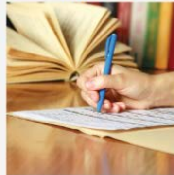
Category III RESEARCH