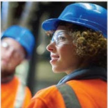
Special award WOMEN-LED INITIATIVES